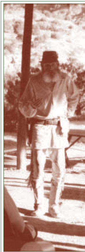
Our Indian historian tells about peace pipes.